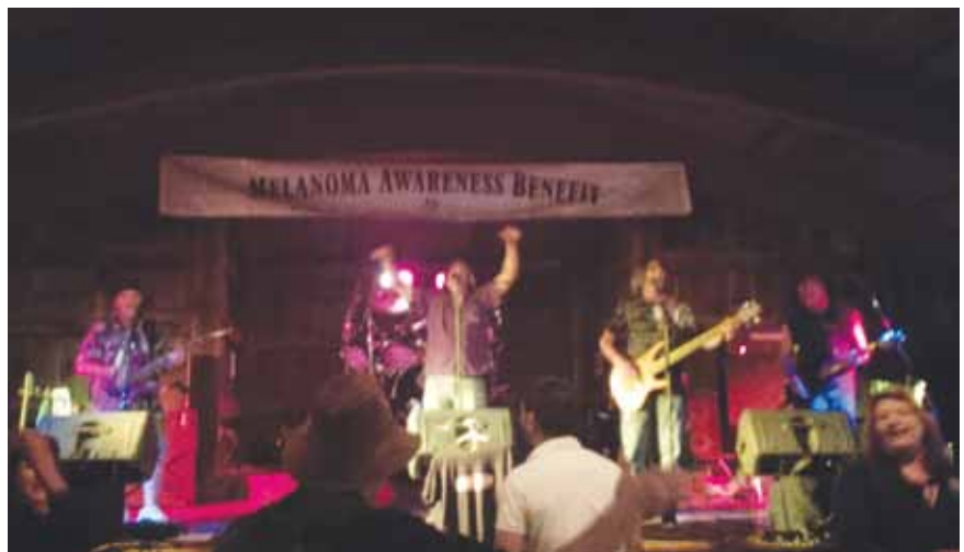
The band "Rock Candy" plays at the 2nd Annual Melanoma Awareness Benefit in Red Lion, PA.