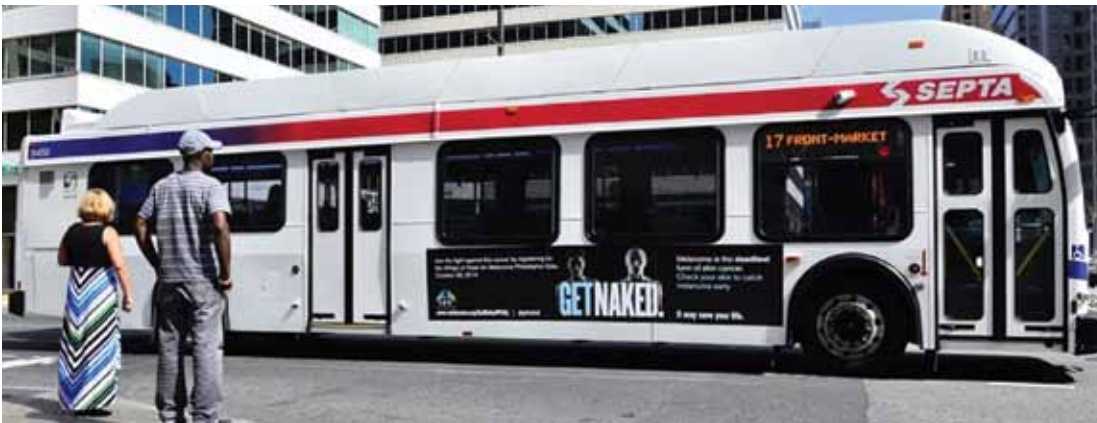
As part of the MRF's #GetNaked awareness campaign, ads with important early detection messages and information about the upcoming Wings of Hope for Melanoma Philadelphia gala were placed on buses in downtown Philadelphia.