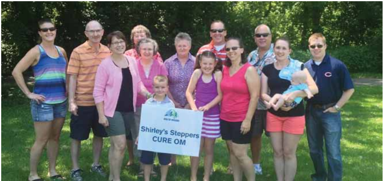
The CURE OM team at Miles for Melanoma Chicago raised $3,975 for the MRF's ocular melanoma initiative.