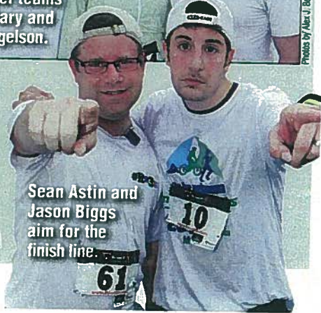
Sean Astin and Jason Biggs aim for the finish line.